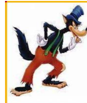
BIG BAD WOLF