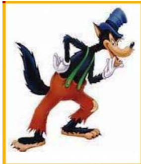
BIG BAD WOLF